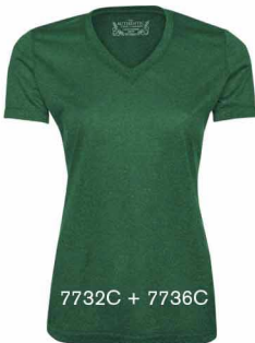
FOREST GREEN HEATHER