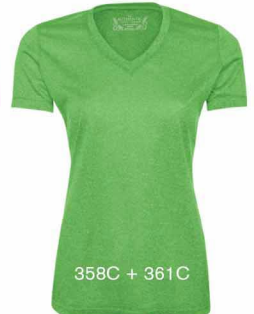
TURF GREEN HEATHER