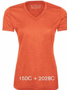
DEEP ORANGE HEATHER