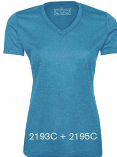
BLUE WAKE HEATHER